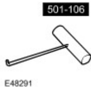
Driver air bag module remover 501-106